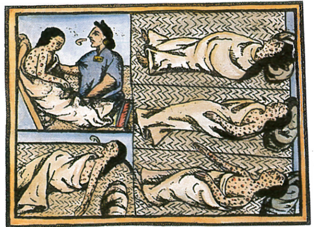
A Diseases brought from Europe, such as smallpox and measles, killed millions of Native Americans who had no resistance to them. This drawing shows Native Americans dying of smallpox.