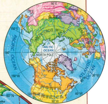
NORTH POLAR VIEW