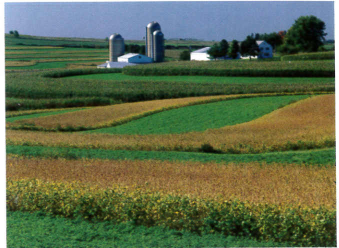
Iowa and Illinois are the leading producers of corn and soybeans in the United States. Both crops are used to feed people and animals, and are also used to make many nonfood items.