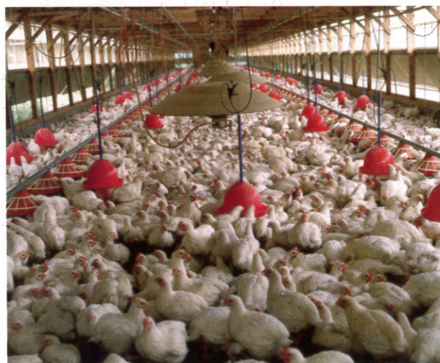
Most farms in the United States are commercial farms, like this chicken farm. Some poultry breeders raise more than a million birds at a time on their farms.

Since the turn of the twentieth century, the United States has moved toward fewer, but much larger, farms. The percentage of people directly engaged in farming has also dropped dramatically.