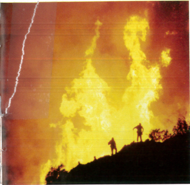
California has the most extreme fire weather in the United States. Strong desert winds and frequent drought combine to produce major wildfires. Valleys and canyons create natural paths for wildfires.