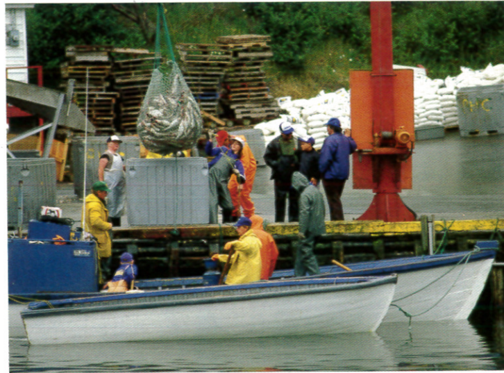
Canada exports nearly US$3 billion worth of fish and fish products. These fishermen are unloading their day's catch of cod in Petty Harbour, Newfoundland and Labrador. Overfishing in Canadian waters has critically endangered several species of fish.