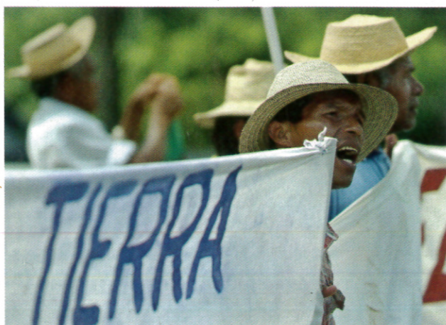
Indigenous protesters in Panama demonstrate against proposals to enlarge the Panama Canal and build more roads—which would result in the loss of land.