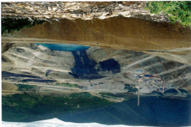
In 1950 there was nothing at this Quebec site but forest. A town soon grew up around a copper mine. When the mine closed in 1999, it left hundreds of unemployed workers and a huge hole in the ground.