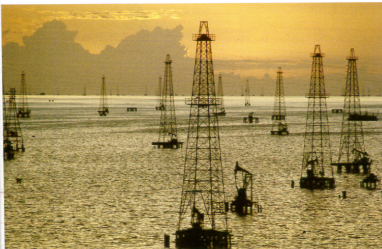
These derricks and pumps are in oil-rich Lake Maracaibo in northwestern Venezuela. Venezuela, a founding member of OPEC (see page 160), has the largest oil reserves in the Western Hemisphere and is the fifth largest exporter of oil in the world.

During an oil crisis, Brazil found an alternative to gasoline—the biofuel ethanol . Made from sugar cane, ethanol today accounts for 40 percent of all vehicle fuel in Brazil. It is cleaner and cheaper to produce than gasoline.